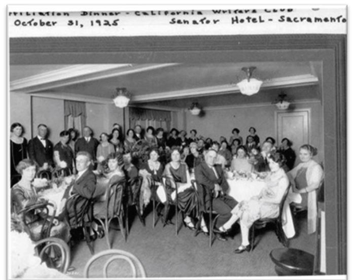
Caption: The affiliation dinner of the newly-formed CWC Sacramento Branch, October 31, 1925, Senator Hotel.

The Sacramento Writers newsletter is published monthly by the California Writers Club Sacramento chapter. ©2025