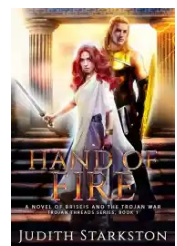
Hand of Fire